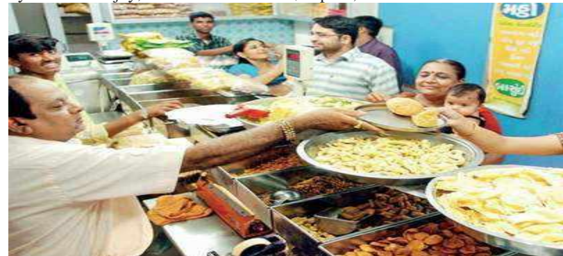
Top snack makers have committed 1 crore litre of oil annually

Even as a new amendment in the Food Safety and Standards Act (FSSAI) mandates that the Total Polarized Compound (TPC) value in edible oil must be less than 25% since July 1, several leading farsaan and sweet makers have found a sustainable way to dispose of used edible oil that can pose a threat to food safety standards and ultimately to people's health. Close to 10 leading sweet and snack makers who are members of the Gujarat Sweets Merchants Association (GSMA) have committed to give up 1 crore litre of used cooking oil annually to the Biodiesel Association of India (BDAI). This will be converted into biofuel so that the used oil does not find its way back to food supply chain the through black market.