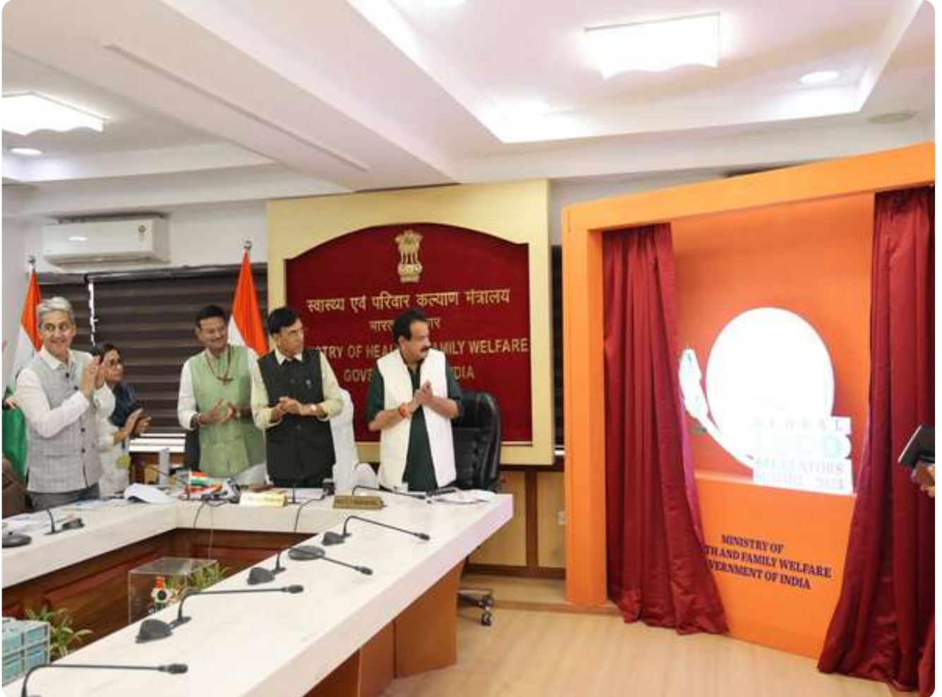
Global Food Regulators Summit 2023 shows new direction for transforming global food regulatory landscape