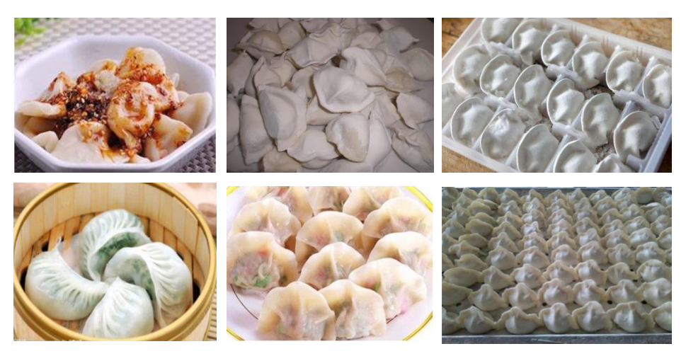
Figure1 Various Jiaozi in China

There are various Jiaozi in China, see Figure 1.