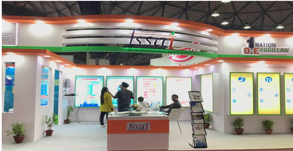
FSSAI Stall in Hall No 18, IITF.