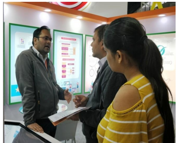
Queries of visitors being addressed