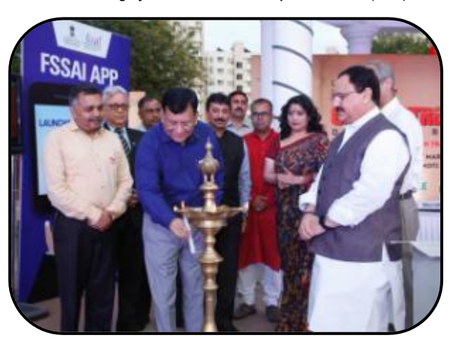
Lighting the Ceremonial Lamp at Launch of Project Clean Street Food