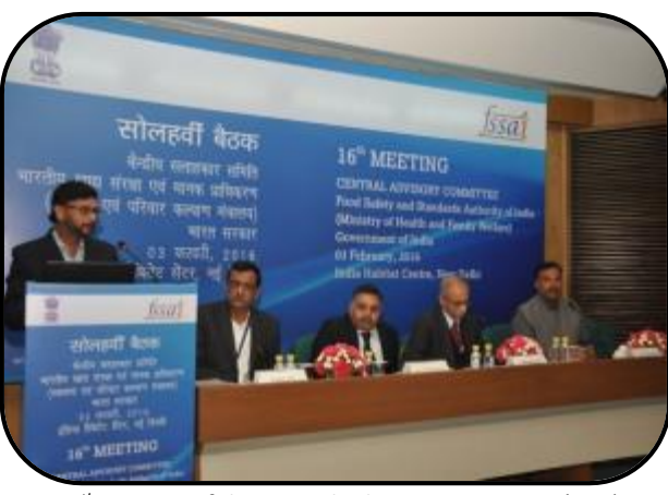
16<sup>th</sup>Meeting of the Central Advisory Committee (CAC)