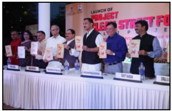
Launching of Project Clean Street Food – Delhi Project

3.3 Food Safety and Standards Authority of India (FSSAI), in partnership with Ministry of Skill Development, Ministry of Health and Family Welfare, Delhi State Government, Tourism and Hospitality Skill Council (THSC), National Association of Street Vendors of India (NASVI) and CII-Jubilant Bhartia Food and Agriculture Centre of Excellence (FACE) launched 'Clean Street Food- Delhi Project'during the Street Food Festival.