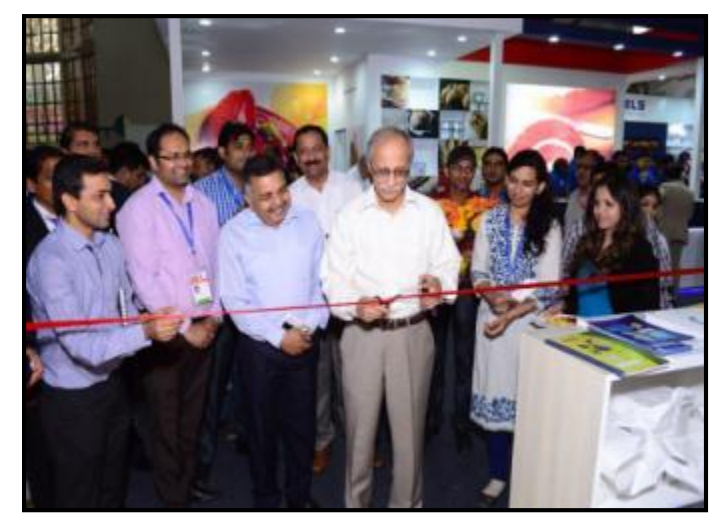
Inauguration of FSSAI's Stall by Chairperson, FSSAI