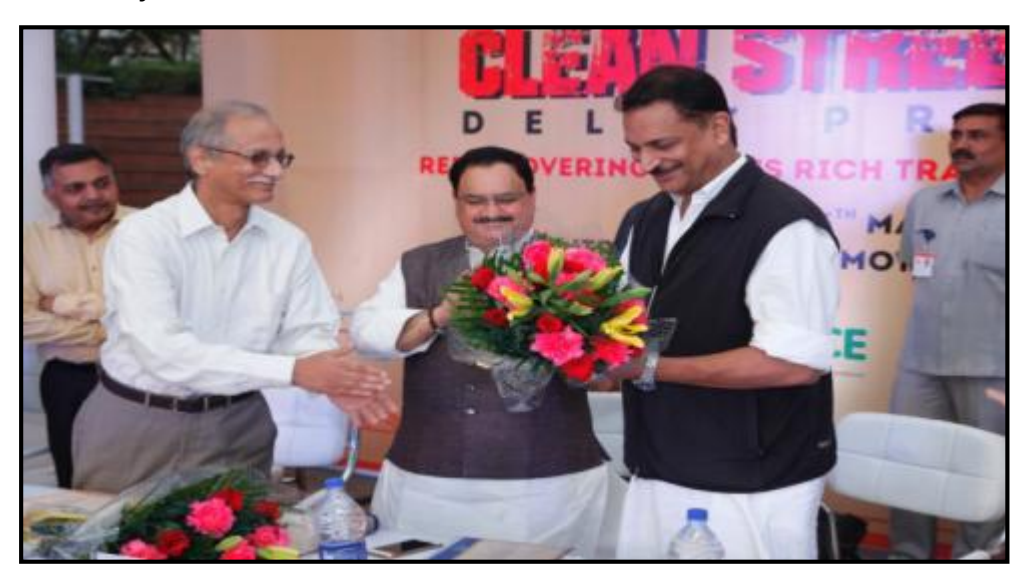
Chairperson, FSSAI welcomes the Guests of Honour

Hon'ble Minister of State for Skill Development and Entrepreneurship (Independent Charge) and Parliamentary Affairs