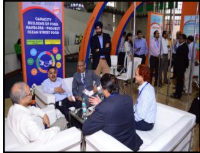
Chairperson and Chief Executive Officer in Conversation with FBOs