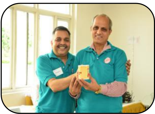
CEO,FSSAI with Joint Secretary (Food), MoHFW during Brainstorming workshop