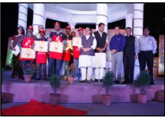
Distribution of I-card and food safety tips leaflet to Street Food Vendors