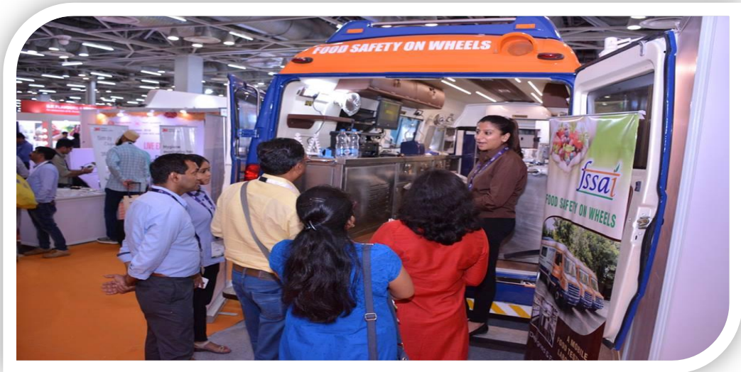
Food Safety on Wheels