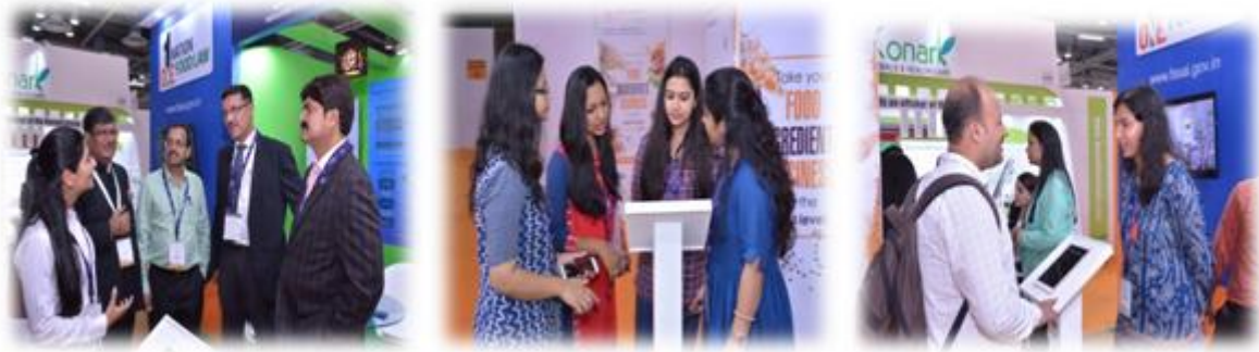
Queries of visitors being addressed.